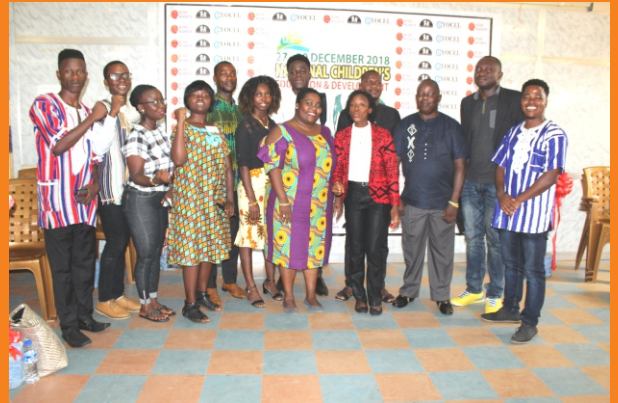
ORGANIZERS AND GUESTS GROUP PHOTO AFTER OPENING CEREMONY