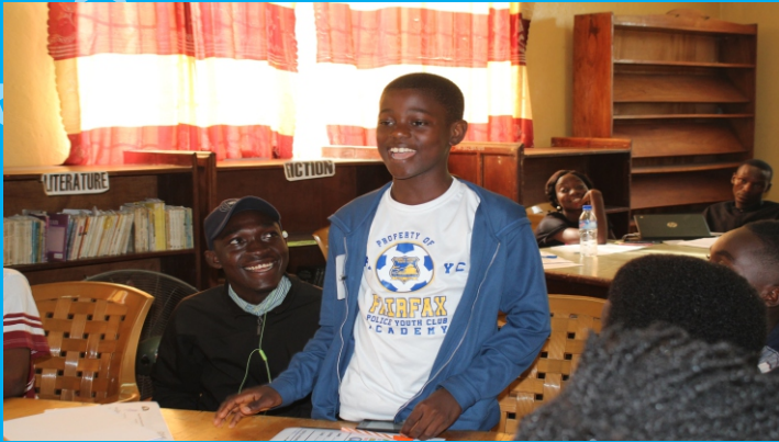
DELEGATES SPEAKING DURING GENERAL CONGRESS