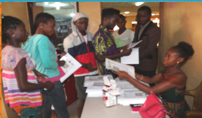
DELEGATES SIGNIN AND RECEIVED CAMP PACKAGE