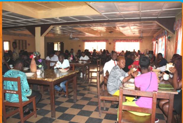
DELEGATES HAVING DINNER