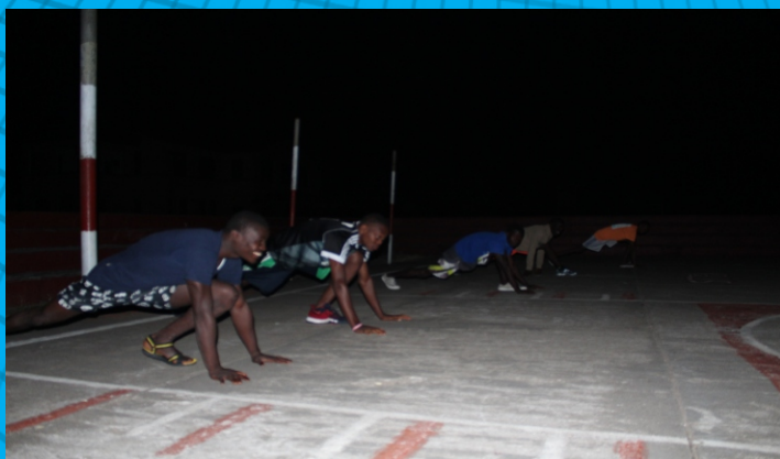
DELEGATES AT ARISE AND SHINE