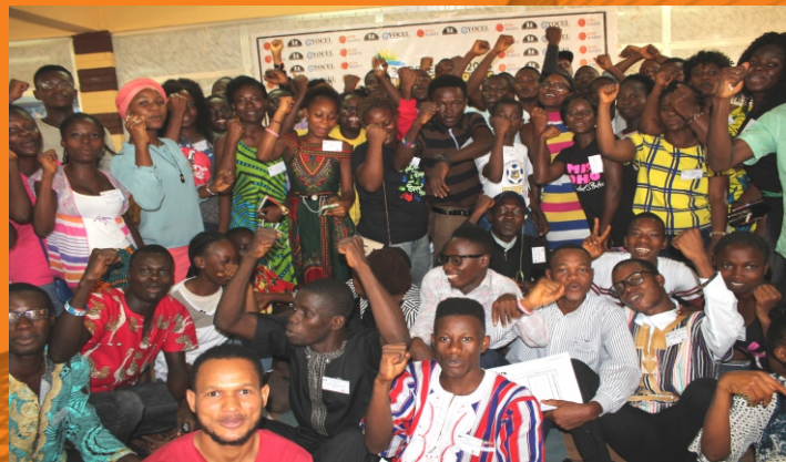
GROUP PHOTO AFTER OPENING CEREMONY