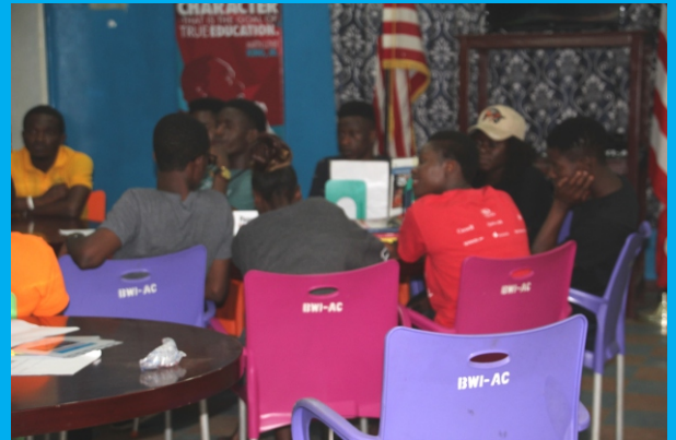
SOT HAVING PLANNING MEETING