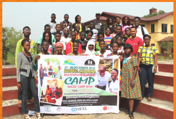
DELEGATES GROUP PHOTO