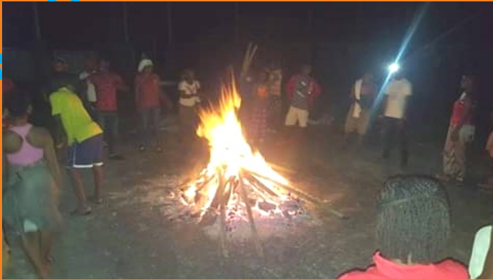
DELEGATES AT CAMP FIRE